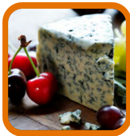
Cheese, cherries, fish boil